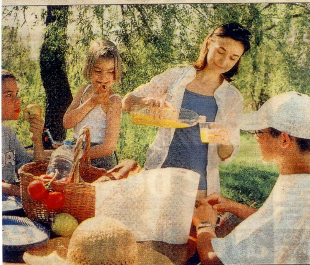
ON: Optimism is high, despite serial disappointments, that this summer will be one to enjoy outdoors

the barbecue, stock up on and get the drinks flowing. Home has adopted 'lawn' as one of its numerous using several shades of the different leaf motifs for priced from €6 to €24, picnic right. It has floor cushion as beachmats, glass lanterns and lanterns. Lollipop with a dot/floral take up the range of table- with pieces at €2. These te with the essories, tum- placemats. in on the act as ing the Midnight as its theme. Its ge uses raspberry and