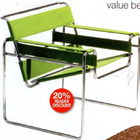
Wassily chair by Marcel Breuer Originally made with a canvas seat stretched over the steel frame, the chair was named after the artist Wassily Kandinsky, who ordered one for his studio. Buy the real thing £1023, The Couch Potato Company Copy the look Vasili-Wassily chair, £215, Dwell

Invest in iconic designs that will hold their value better than your bank account, or copy the look for less