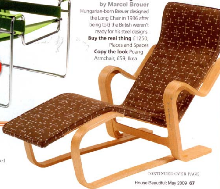
Long chair by Marcel Breuer Hungarian-born Breuer designed the Long Chair in 1936 after being told the British weren't ready for his steel designs. Buy the real thing £1250, Places and Spaces Copy the look Poang Armchair, £59, Ikea