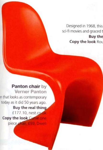
Panton chair by Verner Panton design that looks as contemporary today as it did 50 years ago. Buy the real thing £177.10, nest.co.uk Copy the look Curve one piece chair, £59, Dwell