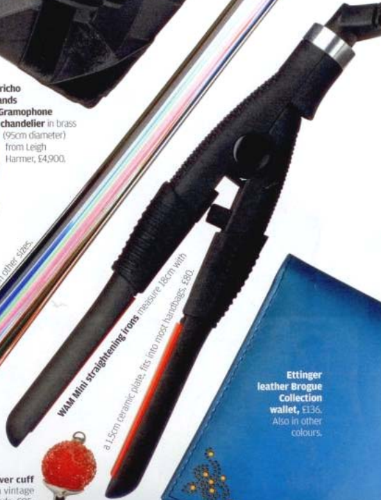
WAM Mini straightening irons measure 18cm with a 1.5cm ceramic plate. Fits into most handbags. £80.