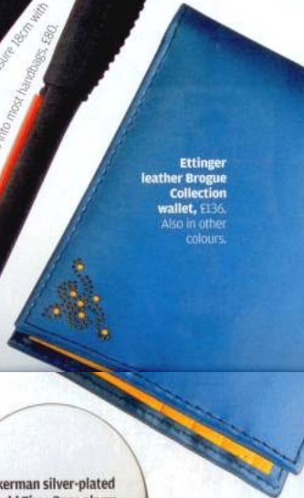
Ettinger leather Brogue Collection wallet , £136. Also in other colours.