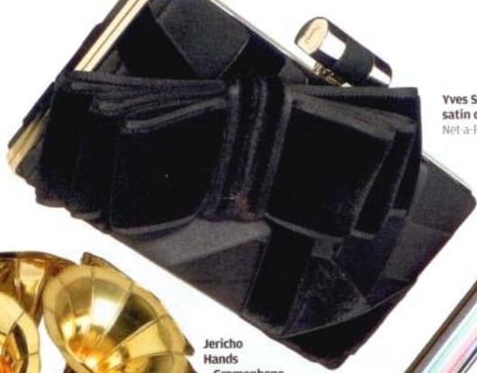
Yves Saint Laurent satin clutch bag from Net-a-Porter.com, £1,045.