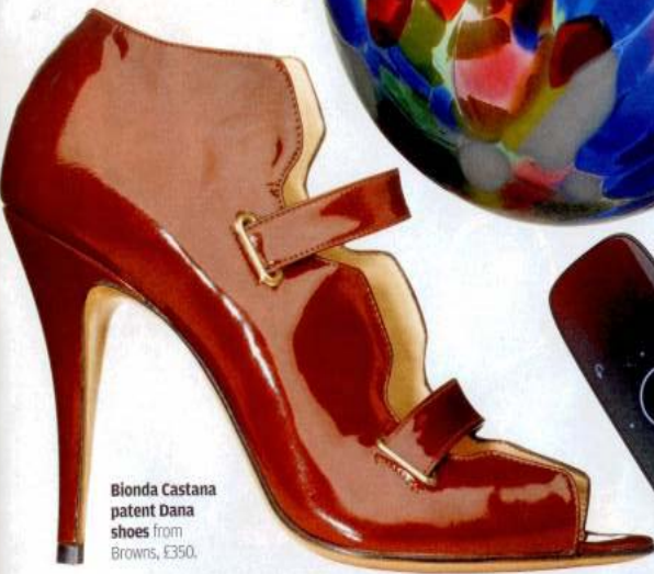
Bionda Castana patent Dana shoes from Browns, £350.