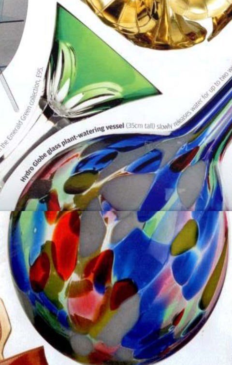
Hydro Globe glass plant-watering vessel (35cm tall) slowly releases water for up to two weeks. £999. Also in other sizes.