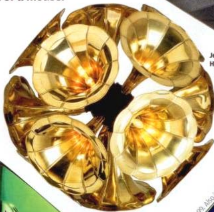
Jericho Hands Gramophone chandelier in brass (95cm diameter) from Leigh Harmer, £4,900.