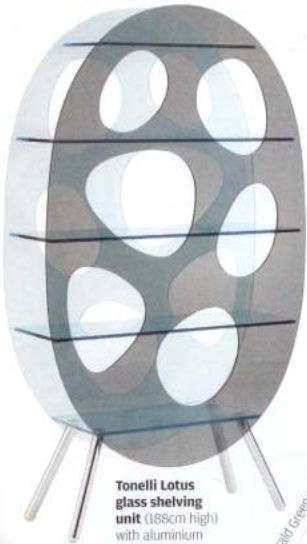
Tonelli Lotus glass shelving unit (188cm high) with aluminium legs by Karim Rashid from Go Modern, £3,590.

Devilish doodahs and funky knick-knackery at the click of a mouse.