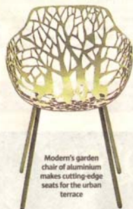
Modern's garden chair of aluminium makes cutting-edge seats for the urban terrace

Wirework furniture, not the frenzied, overwrought variety, but with a simpler, more linear twist, is the hot news from Indian Ocean, though cushions are called for to avoid a criss-cross bottom. The attractive Venus range — see it at Selfridges now — includes circular coffee and dining tables, all in white, lightweight frames of tubular steel with galvanised steel mesh; prices from £194. If you prefer your metal a little more solid in style, take a chilly seat on the lime green aluminium Forest garden chair, £400, from Go Modern, along with its sister, the Roses armchair, with its large cutwork blooms; their dolly-like designs, filched from nature, look as