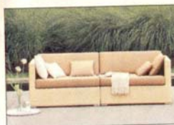
The Lidó range from Garpa has individual seating blocks to make your outdoor sofa as large as you like