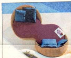
Sprawl in the sun on Go Modern's Neptune double day bed — even the cushions are weatherproof

If they were cut from a stencil, John Lewis offers a more conventional two-seater steel bench, powder-coated in white, with a prettily curved back. A steal at £176, it would look at home in any setting.