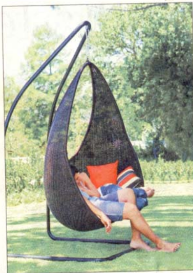
Left: The Nest chair from John Lewis is made from weather-resistant wicker hangs from a tubular steel frame